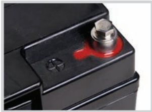
Red (+) Battery Cable Connection