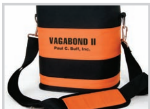
The VBAGII with Shoulder Strap