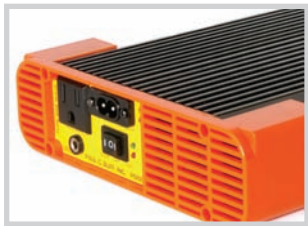
The PSI900GF Inverter

The Vagabond™ II includes a 20Ah, 12 Volt SLA (Sealed Lead Acid) internal battery. The new, larger battery offers longer life with added protections to eliminate charging idiosyncrasies. With the new plug-and-play design, the battery can be easily replaced by the user when needed ( please contact our customer service team for replacement batteries ).