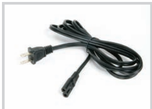
The Battery Charging Cord