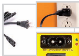
To AC Power / To Inverter