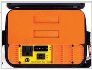
Lifted Battery Cover