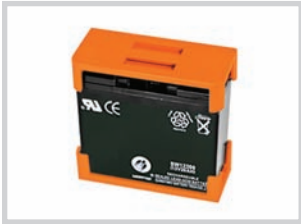
Battery / Battery Cover and Base