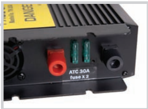
Fuses (on bottom of inverter)