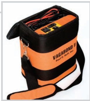
The Vagabond™ II System