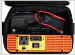
Battery Exposed (Cover Removed)