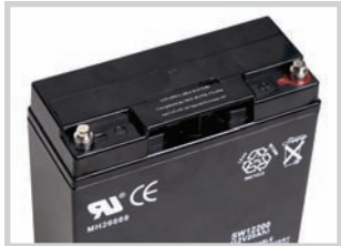
The B20A Battery

Auxiliary battery cables are provided, allowing you to use an alternate battery (such as your car's battery) when needed. The two cables (one red, one black) are fitted with alligator clips for connection ( please contact our customer service team for replacement cables ).