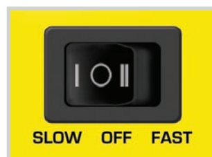
Power / Setting Switch