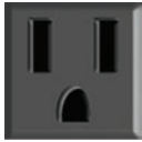
120VAC 60HZ OUT

The power cord on your flash unit (White Lightning™, AlienBees™, Einstein™) or power pack (Zeus™) plugs into this 120 VAC 60 Hz power outlet. To power multiple lights, a multi-outlet power strip can also be plugged into this outlet. When determining the number of lights that you can power with a single Vagabond™ II, the practical limits are based on the total amount of wattseconds being cycled. 5000 True Ws is a good estimate of the largest practical load (up to 4 to 6 flash units). Heavy loads will reduce the efficiency - the more wattseconds connected, the longer the recycle times.