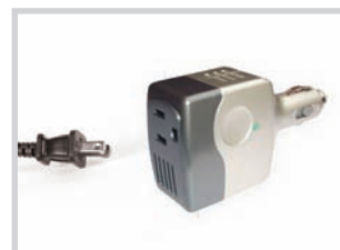
The VCA Car Adapter