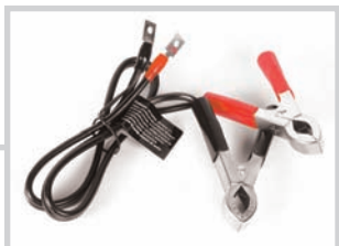
The Auxiliary Battery Cables

IT IS VERY IMPORTANT that you connect the Vagabond™ II's battery to the charger after each use (no matter how short). Failure to connect the charger will result in loss of battery efficiency. With proper care, this type of battery can be charged several hundred times before replacement.