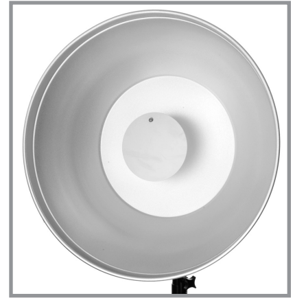
Beauty Dish with direct-light blocker installed