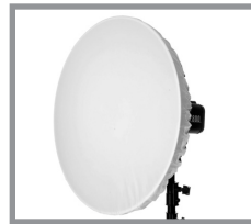
Beauty Dish with diffusion sock