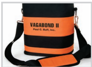
The VBAGII with Shoulder Strap