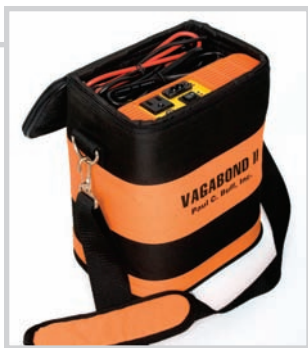
The Vagabond™ II System